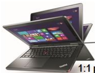
1:1 program ... Patterson Lakes Primary School